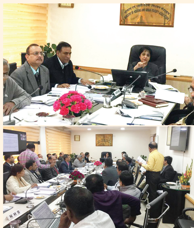
18 th CSMC Meeting held on January 18, 2017

A total Central Share of Rs.4205.50 Cr. is involved for 2.80 Lakh houses accepted as above.