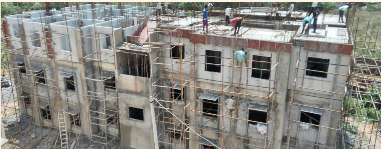
Demonstration Housing Project at Chandrashekharpur, Bhubaneswar, Odisha being constructed by BMTPC using Expanded Polystyrene Core Panel System (EPS) Technology