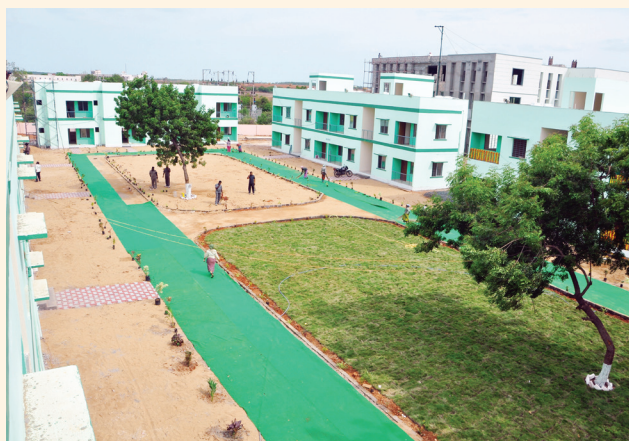
Completed Demonstration Housing Project at Nellore, Andhra Pradesh constructed by BMTPC using Glass Fibre Reinforced Gypsum (GFRG) Panel Technology